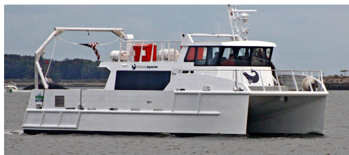
Maritime Aquarium at Norwalk's vessel 'Spirit of the Sound' equipped with BAE Systems HybridGen technology and Li-ion batteries for energy storage.

Offshore vessels could increase efficiency and reduce emissions. A variety of vessels, ranging from smaller Crew Transfer Vessels (CTV) typically 18 to 24m and Service Operations Vessels (SOV) typically 70 to 90m are used in the construction and operation of offshore wind turbines. Hybrid solutions lend themselves to the more predictable duty cycles for vessels used in the Operations and Maintenance (O&M) phase.