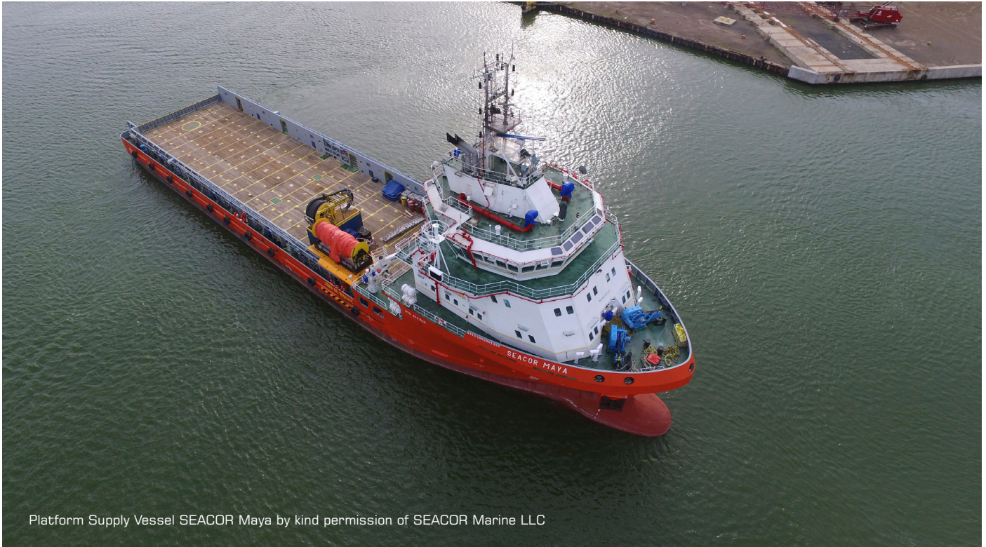
Platform Supply Vessel SEACOR Maya

Insight for the professional fast boat sector